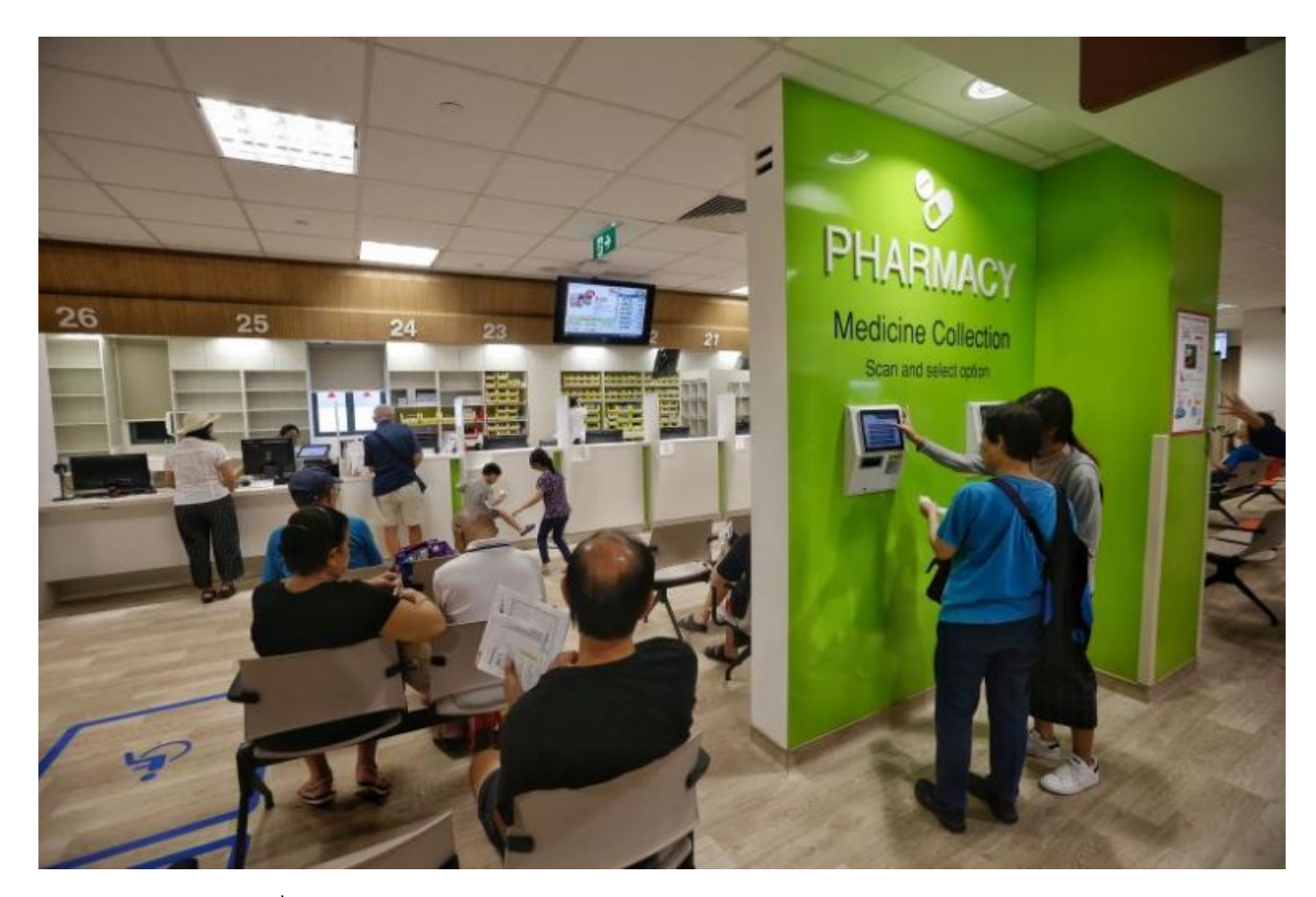
The $44 million polyclinic began operations in January 2018 after moving from Ang Mo Kio Avenue 8 to an 8,752 sq m facility at Ang Mo Kio Central 2, which is three times bigger.