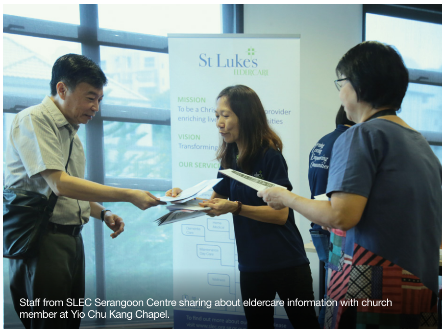
Staff from SLEC Serangoon Centre sharing about eldercare information with church member at Yio Chu Kang Chapel.

to share our work with church members of Church of Singapore Marine Parade, Telok Ayer Chinese Methodist Church and Yio Chu Kang Chapel. Thank you for partnering us to impact our communities for the Kingdom of God.