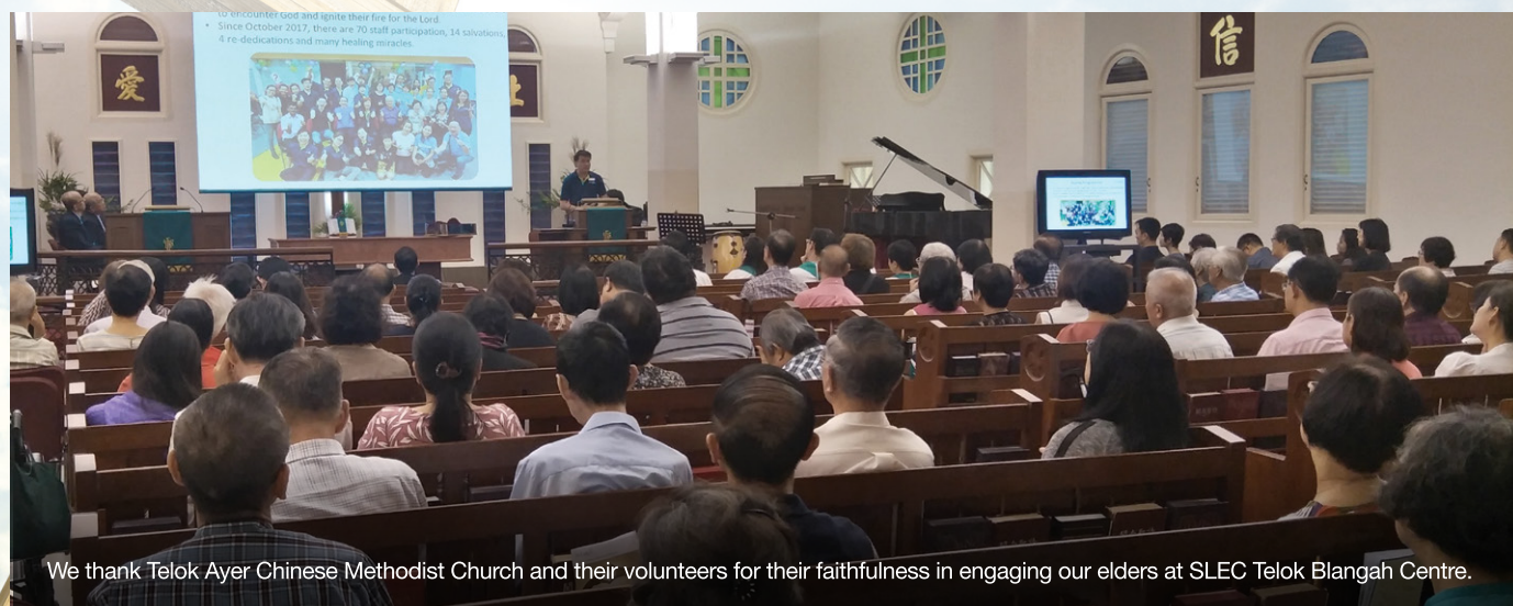
We thank Telok Ayer Chinese Methodist Church and their volunteers for their faithfulness in engaging our elders at SLEC Telok Blangah Centre.