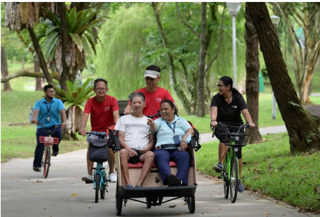
The trishaw ride scheme was started by the charity in 2017 as a way for seniors to spend time in the community.