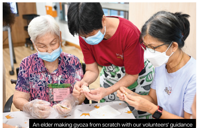
An elder making gyoza from scratch with our volunteers' guidance

This event was part of the SLEC Dining Culture programme supported by the fundraising efforts of SLEC's ChopeASeat campaign last year.