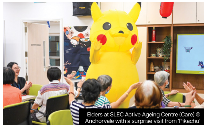
Elders at SLEC Active Ageing Centre (Care) @ Anchorvale with a surprise visit from 'Pikachu'

The day ended with a feast of Japanese delights, including Japanese curry and miso soup. As the elders indulged in their meal, the talented staff at SLEC Active Ageing Centre (Care) @ Anchorvale performed international classics like "Top of the World" and the Doraemon theme song.