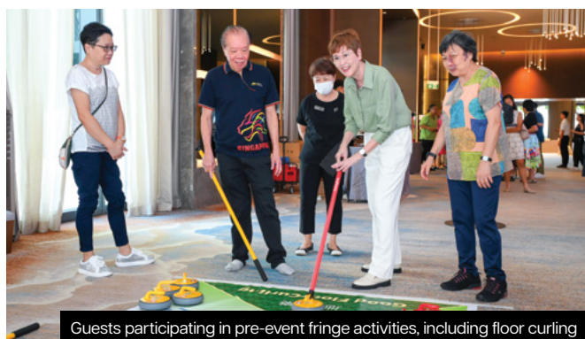
Guests participating in pre-event fringe activities, including floor curling

Volunteerism is a lifelong journey. By working together with like-minded partners and strengthening our bond, we are able to make a deeper impact. We extend our heartfelt appreciation to all who have supported us thus far!