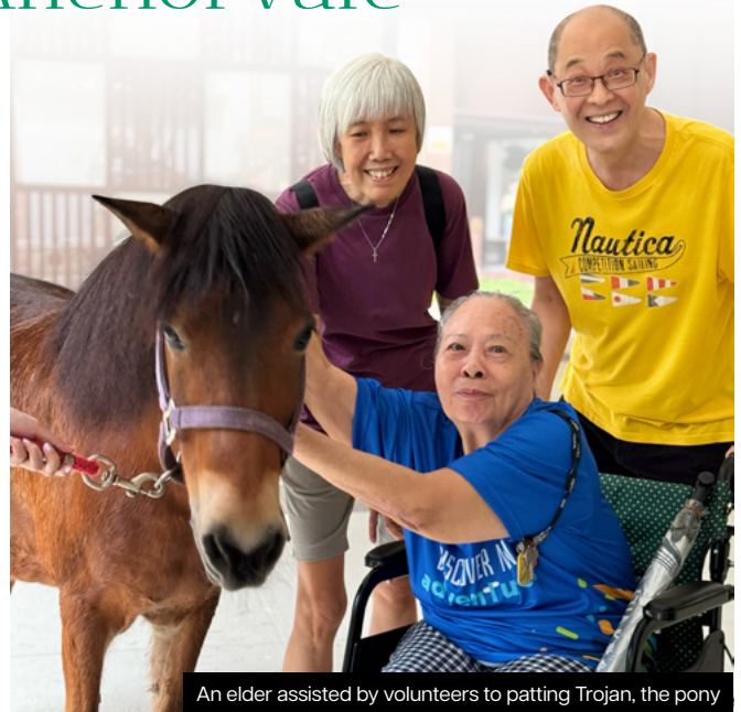
An elder assisted by volunteers to patting Trojan, the pony