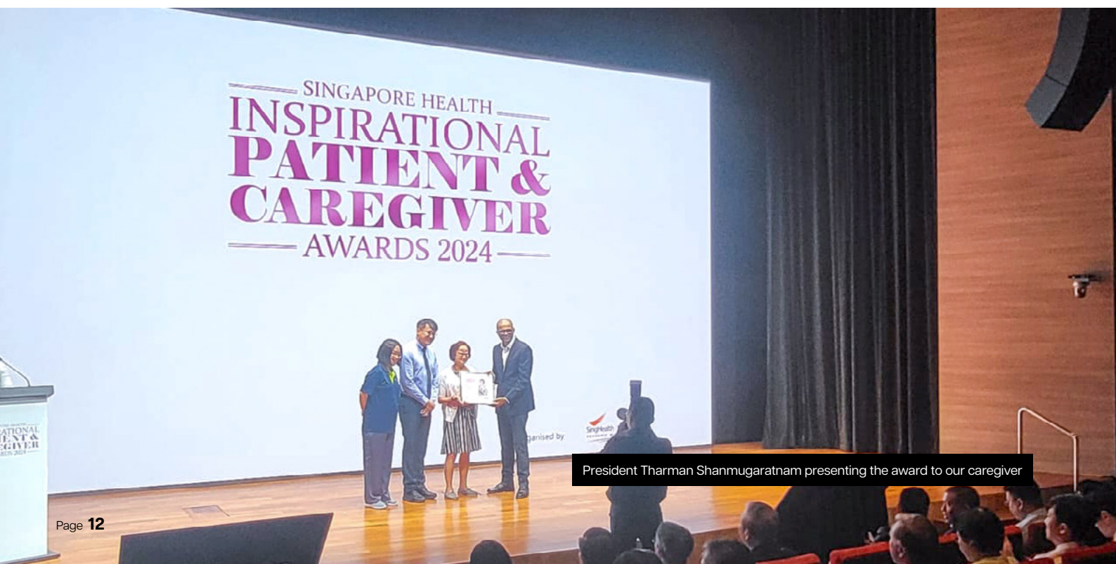
President Tharman Shanmugaratnam presenting the award to our caregiver