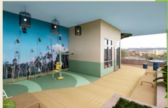
Artist's impression of outdoor rehabilitation area.

Annually, each SLEC Residence (nursing home) requires an additional $2,000,000 in support, which goes towards the provision of curated programmes and enhancements, as we create a personalised experience for the elders entrusted in our care.