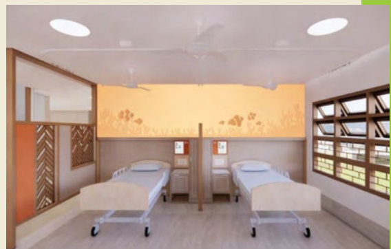
Artist's impression of residential floor.