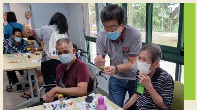
PSA H@H volunteers engaging SLEC elders with art and craft activities.

"At the end of the day, we wish to make memories with our beneficiaries. The social interaction and friendship with them are priceless, and if we can impact them positively, we have achieved our volunteering goal of making a difference in their lives."