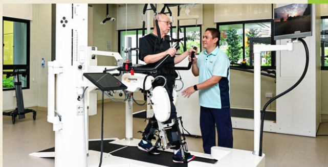
Rehabilitation robotics at SLEC Active Ageing Hub@Northshore.